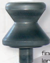
final shaping roll large Art.-No. 567055