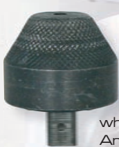
wheel house roll Art.-No. 567052