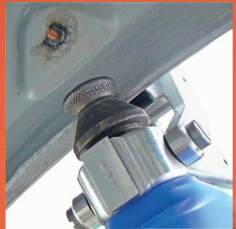
RFW 2000 quick and efficient