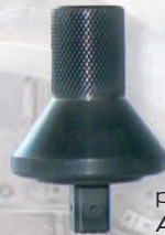
pre shaping roll Art.-No. 567053