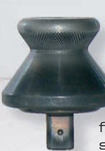
final shaping roll small Art.-No. 567054