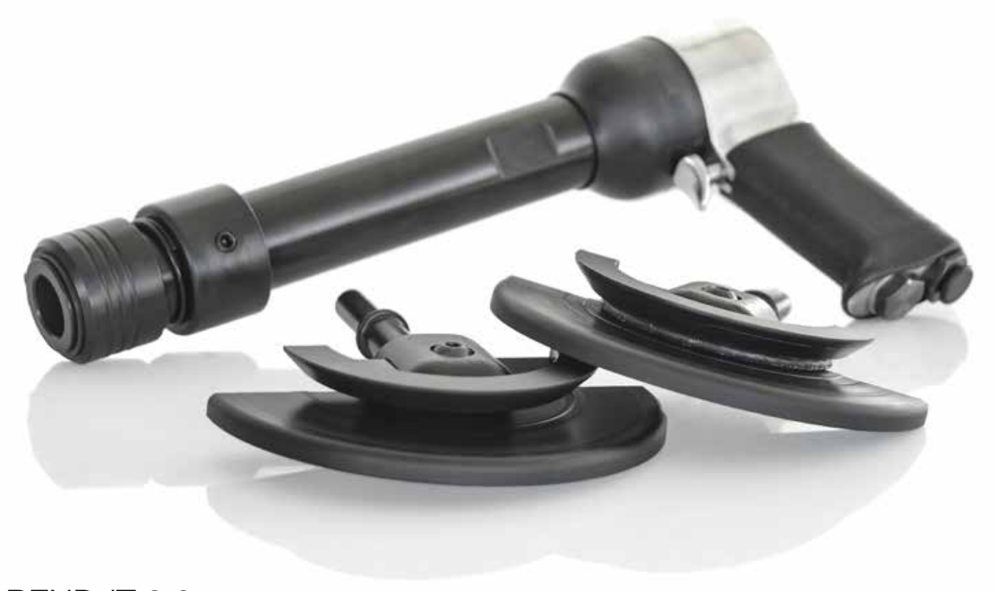
BEND-IT 2.0 Our patented bending machine.

The BEND-IT 2.0 System is a patented tool for bending, which includes a special pneumatic impact hammer as well as different slip-on pillows to bend sheets on cars in a new and easy way. Regarding the innovative relevance this System impresses due to its easy and fast usage. With only one operation, you are able to bend a sheet, like the wheel house of a car. You can do this in only a few minutes and without big expenditures of energy. The BEND-IT 2.0 impact hammer drives the sheet in the fold of the pillow and pushes itself by strokes and vibrations. In order to work more practica- ble and easier, there are several types of pillows with a different profile and diameter depending on form and the feature of the car sheet. By using the Bend-it system, which is a totally new way to repair, you have a more cost-effective, sustainable and easier repair on car sheets like door leaves and wheel houses.