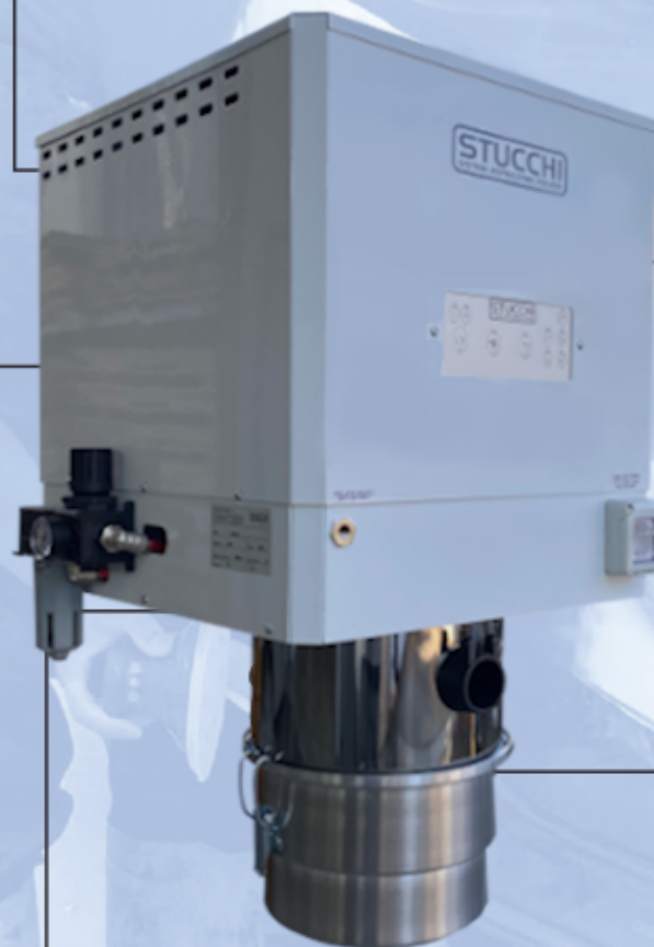
TKW22 2,2 kW