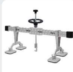
Crossbar Lifter (Optional)