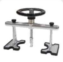
Quick Puller (Optional)