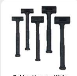
Rubber Hammer Kit for Car Body Repairs (Optional)