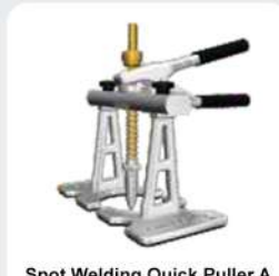
Spot Welding Quick Puller A