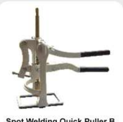
Spot Welding Quick Puller B