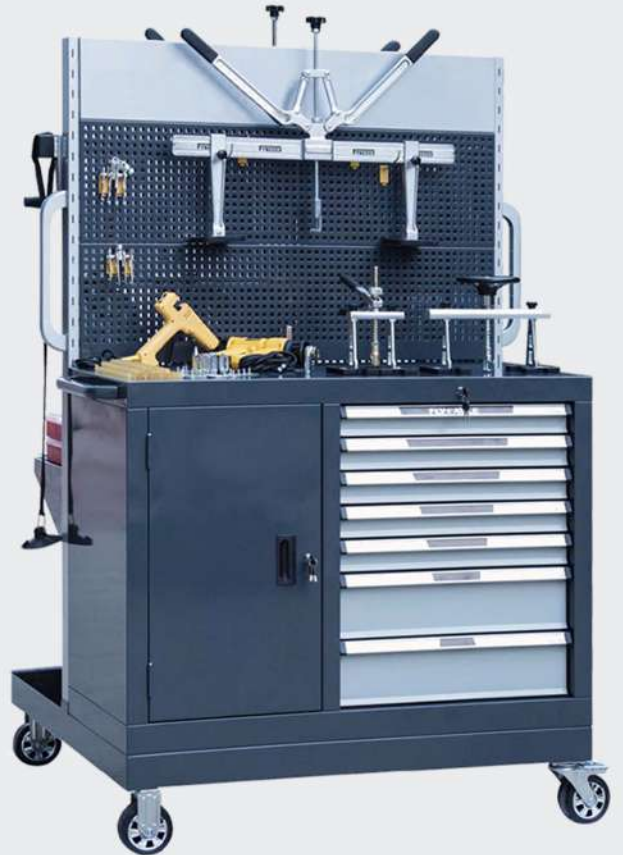
Pictures are for illustration purposes only - actual product may differ from images

The FY - 9038 is specialised for aluminium car body repair, which includes various combinations, such as tools for collision repair, IGBT inverter aluminium dent puller, crossbar lifters, dent repair glue pulling kit etc. Optional tools and IGBT inverter aluminium dent pullers are available to meet users' needs.