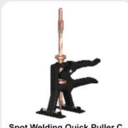
Spot Welding Quick Puller C (Optional)