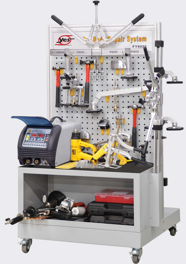
Pictures are for illustration purposes only - actual product may differ from images

The professional spot welding quick puller has various car body repair modes and is approved by many workshops. The dent repair glue pulling kit allows easy paintless dent repair of car body panels without welding. The CRS-8209 has the most advanced international IGBT inverter technology combined with a user-friendly design and international advanced car body repair technology. It also includes a complete set of car body repair tools that meet international standards including various high-quality quick repair pullers which can achieve excellent results on steel or iron panels.